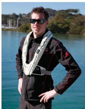
PFD level-100 (inflatable)