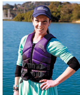
PFD level-50s (non-inflatable)

Table below indicates links for State/Territory Maritime Departments